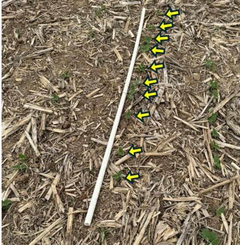
Figure 1 . Photos of 5-ft rows in two soybean fields showing the reduction of plant stands caused by slug feeding: 4 plants (left) and 10 plants (right), shown with yellow arrows, in center rows. Under normal conditions, there should be 20 to 30 plants per 5-ft row (Photo: Raul. Villanueva, UK).