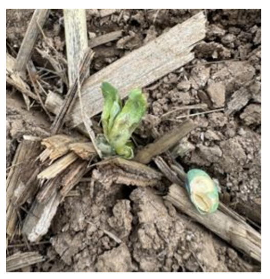
Figure 2B . Feeding damage on emerged and unsprouted seed