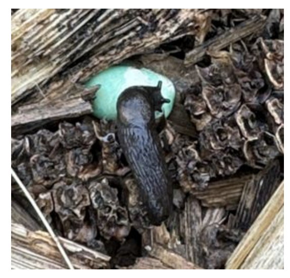
Figure 2A. Slug feeding on pesticide coated, swollen, and unsprouted soybean seed.